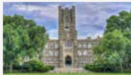
D Fordham University Residential en-suite 12-18 years