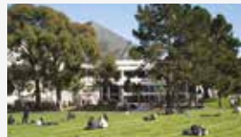
H UC Berkeley Residential 10-19 years