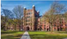
F Yale University Residential 13-19 years