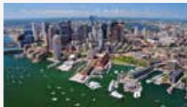
C Boston University Residential 10-17 years