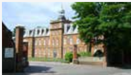
I Epsom College Residential shared 9-12 & 13-17 years