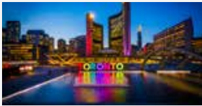
B York University Residential 10-19 years