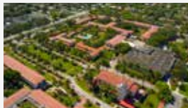
G Barry University Residential apartment style with private bathroom 12-18 years