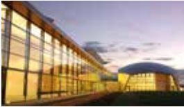
R University of Hertfordshire Residential en-suite 9-12 & 13-18 years