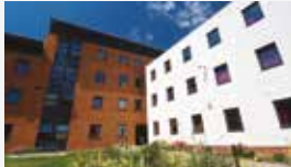
F Eastbourne Campus, University of Brighton Residential and Homestay 9-12 & 13-18 years