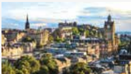
H Edinburgh Academy Residential en-suite 12-18 years