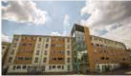
S University of Westminster Harrow Campus Residential en-suite 12-18 years