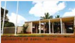
J University of Hawaii Residential 10-19 years