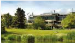
Q University of Bath Residential shared or en-suite 9-13 & 14-18 years