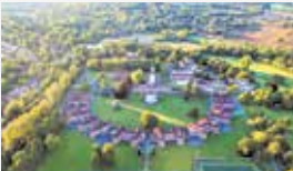
M RMS School Residential shared 7-12 & 13-17 years