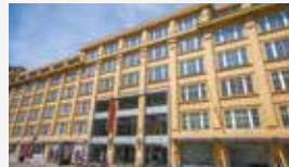
K King's College Residential en-suite 12-18 years