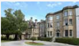
T Warminster School Residential shared 8-12 & 13-17 years