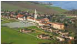
N Royal Hospital School Residential shared or en-suite 8-12 & 13-17 years