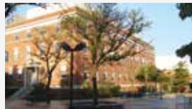
E Saint Peter's University Residential & Homestay 12-19 years