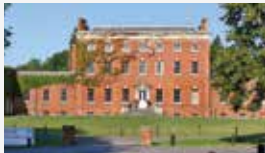
C Berkshire College Residential and Homestay 7-12 & 13-17 years