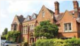
P St Joseph's College University of Reading Residential shared or en-suite and Homestay 10-13 & 14-18 years