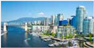
A University of British Columbia Residential 10-19 years