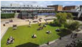
B Brunel University Residential en-suite 9-12 & 13-18 years