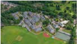
L LVS Licensed Victuallers School Residential shared 9-12 & 13-17 years