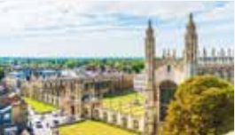
D Cambridge University hosted at Hughes Hall Residential shared or en-suite 12-18 years